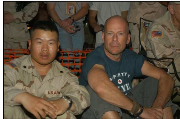
Camp Arifjan, Kuwait, 2003.