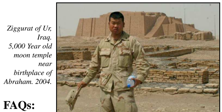
Ziggurat of Ur, Iraq. 5,000 Year old moon temple near birthplace of Abraham. 2004.